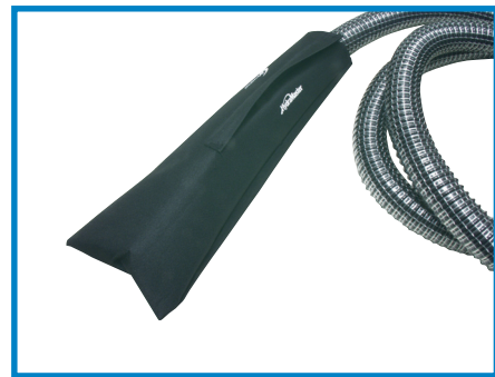
Each upholstery tool comes with a protective head cover.

Cleaning with the DriMaster Upholstery Tool is just plain faster. The high flow – low residual moisture effect of this new technology leaves the fabric cleaner and drier while greatly reducing the chances of damage.